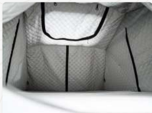
Lite 2.0 Thermal Kit £195