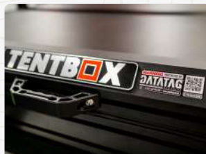
Datatag Security Kit £59