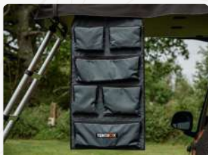
Utility Pockets £55