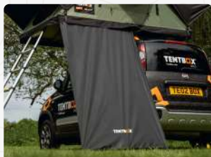
Lite Windbreak £50