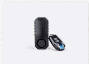
TentBox Security Alarm £25