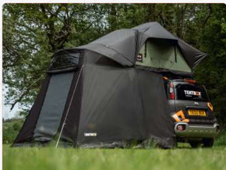
Lite 2.0 Living Pod £295