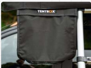
Boot Bag £35