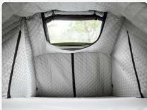
Lite XL Thermal Kit £245