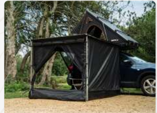
Side Awning Room £345