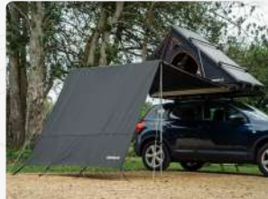
Side Awning Wall £95