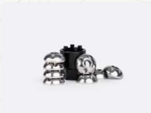
Security Nuts £50