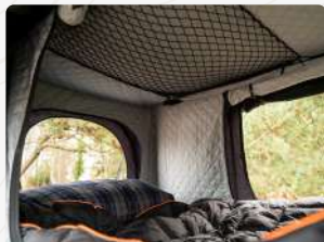
Classic Thermal Kit £245