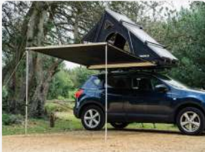
Side Awning £295