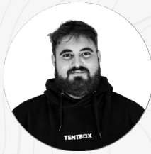
Lucas Product Specialist