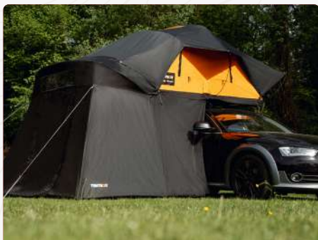
Lite XL Living Pod £395